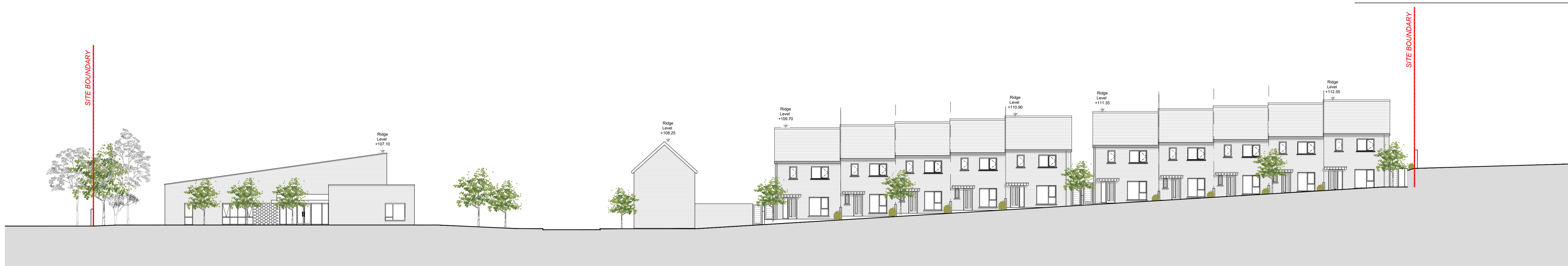
Context Elevation A-A

THIS DRAWING TO BE READ IN CONJUNCTION WITH ALL ARCHITECTS DRAWINGS, SPECIFICATIONS CONSULTANT'S DESIGN TEAM DRAWINGS AND SPECIFICATIONS.